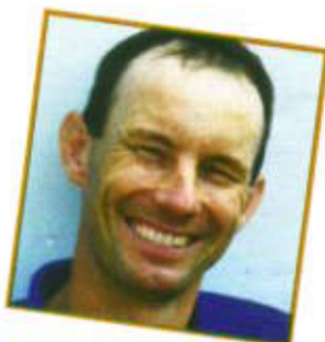
Robert Hewitt Construction

The use of bold planting schemes and modern materials is of particular interest, where the combination of contemporary and traditional are fused together to produce attractive, practical environments (07745 094 985).